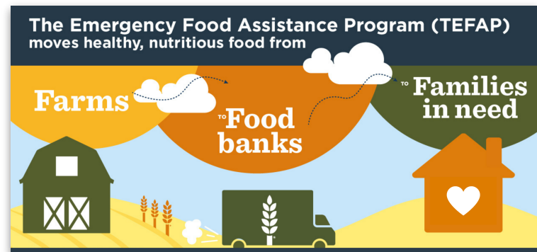
TEFAP moves food from farms to food banks to families.

Our nation's food banks, and programs like TEFAP and CSFP that support them, are lifelines for families who struggle to put food on the table. Charitable donations alone can't ensure that families get enough to eat — we need the government to do its part to keep food bank shelves full.